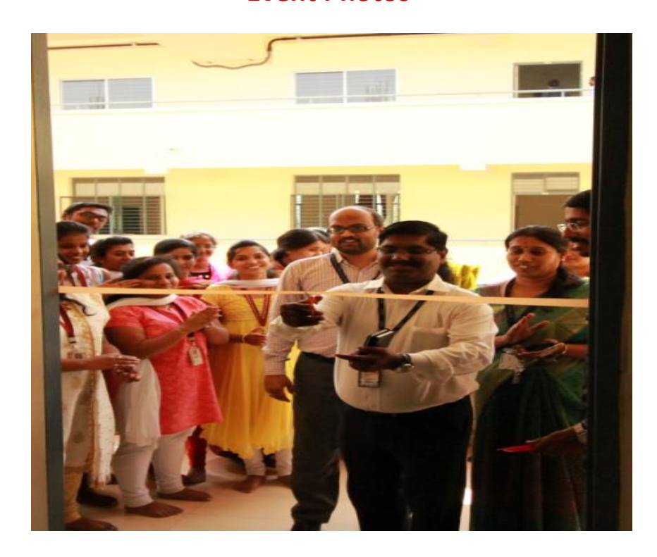
Jury Member inaugurating the project exhibition