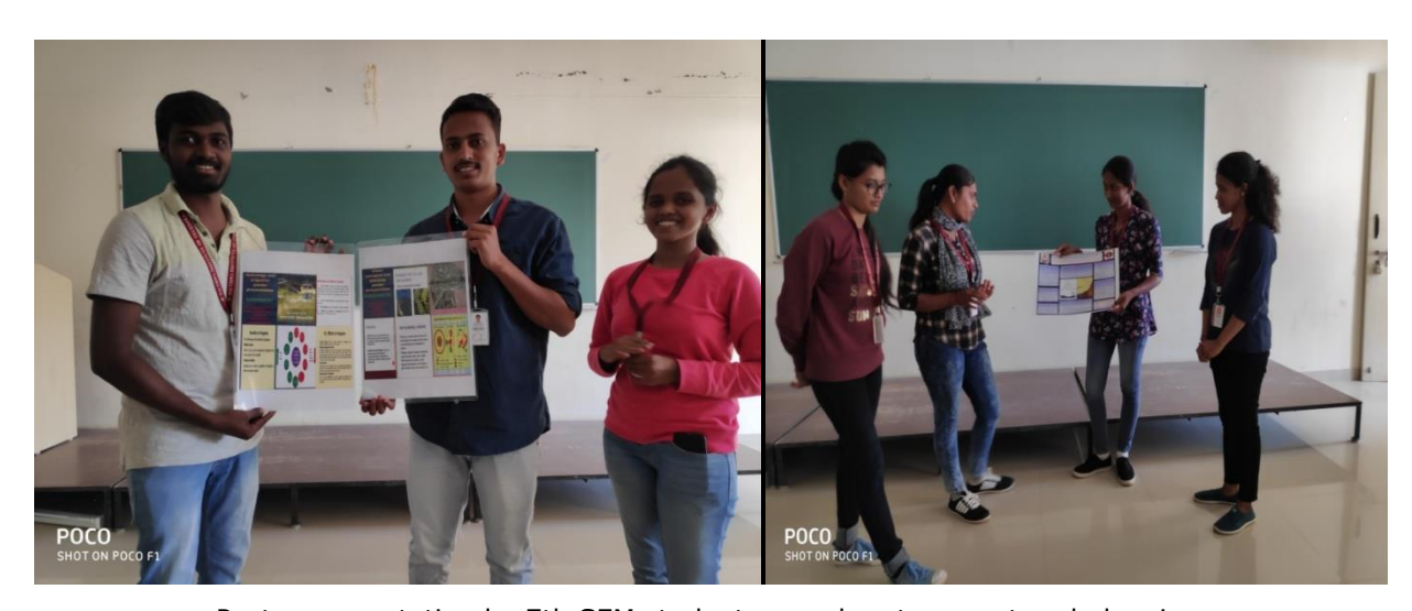
Poster presentation by 7th SEM students on urban transport and planning