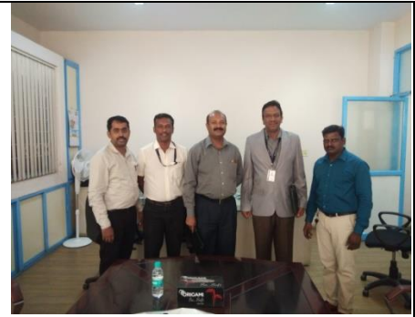
MOU with KGTTI