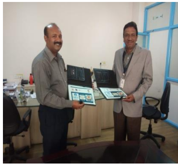
MOU with KGTTI