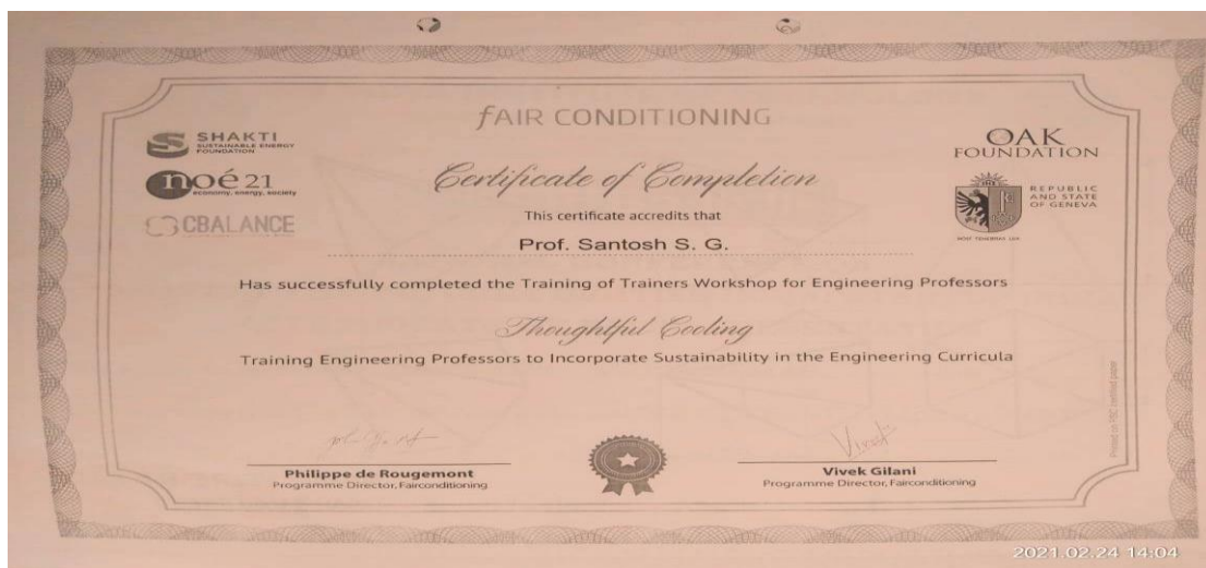
Certificate issued to SVIT Mechanical staff for attending workshop conducted by C-Balance

Outcome: Trained faculty on Refrigeration and Air Condition