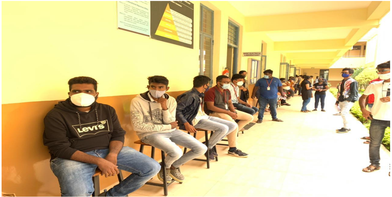
Students waiting for vaccination in a queue