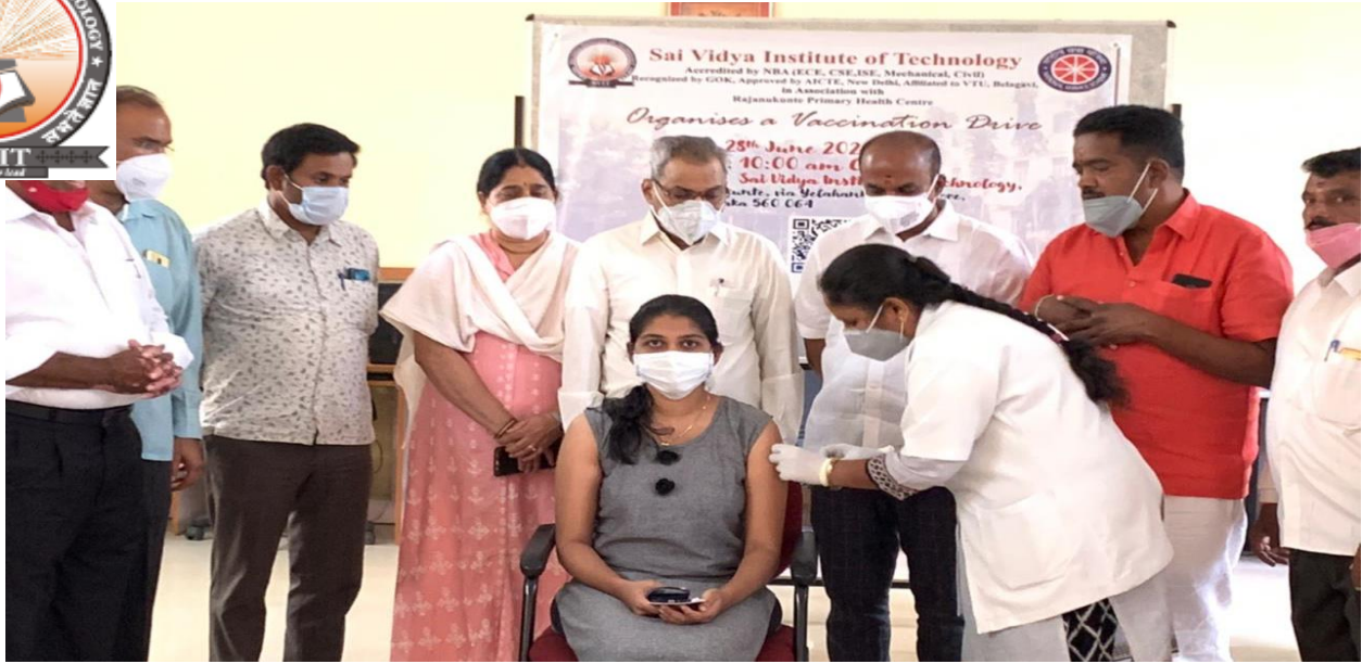
Vaccination to our student