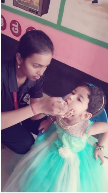
NSS Programme Officer