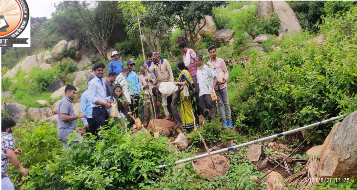
Volunteers carrying saplings to hill top