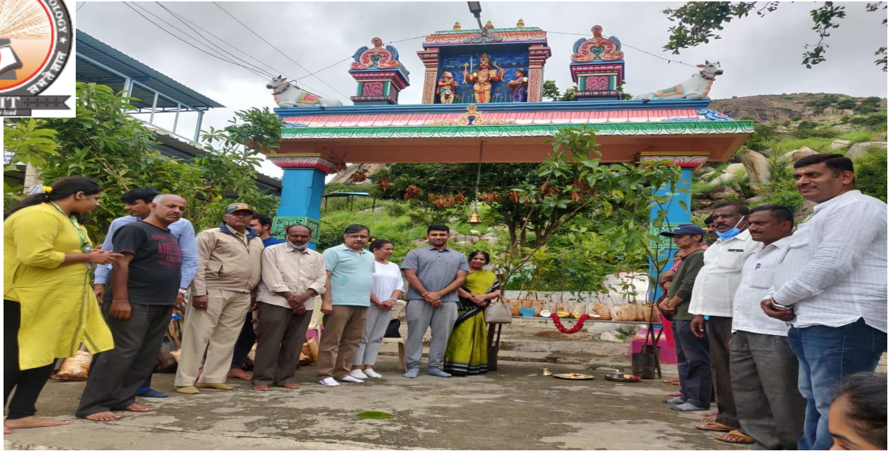
Volunteers with guest and officials