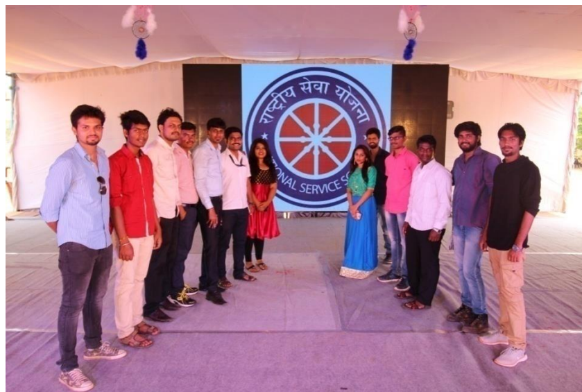
NSS Programme Officer