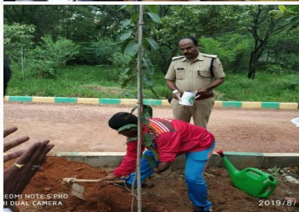
NSS Programme Officer