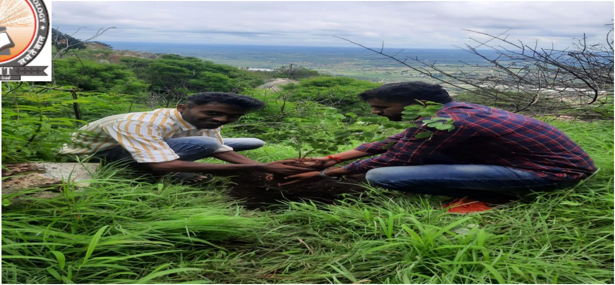
Plantation form our Sai Vidya Faculty