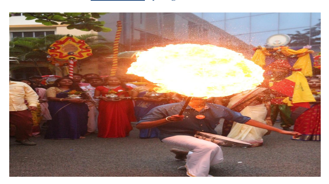
'Fire Stunts' by Shreevatsa