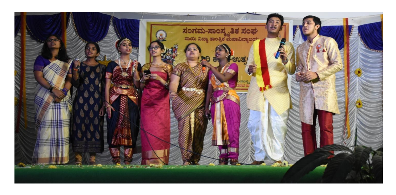
'<u>Janapada Geethae</u>' by Eshanya & team