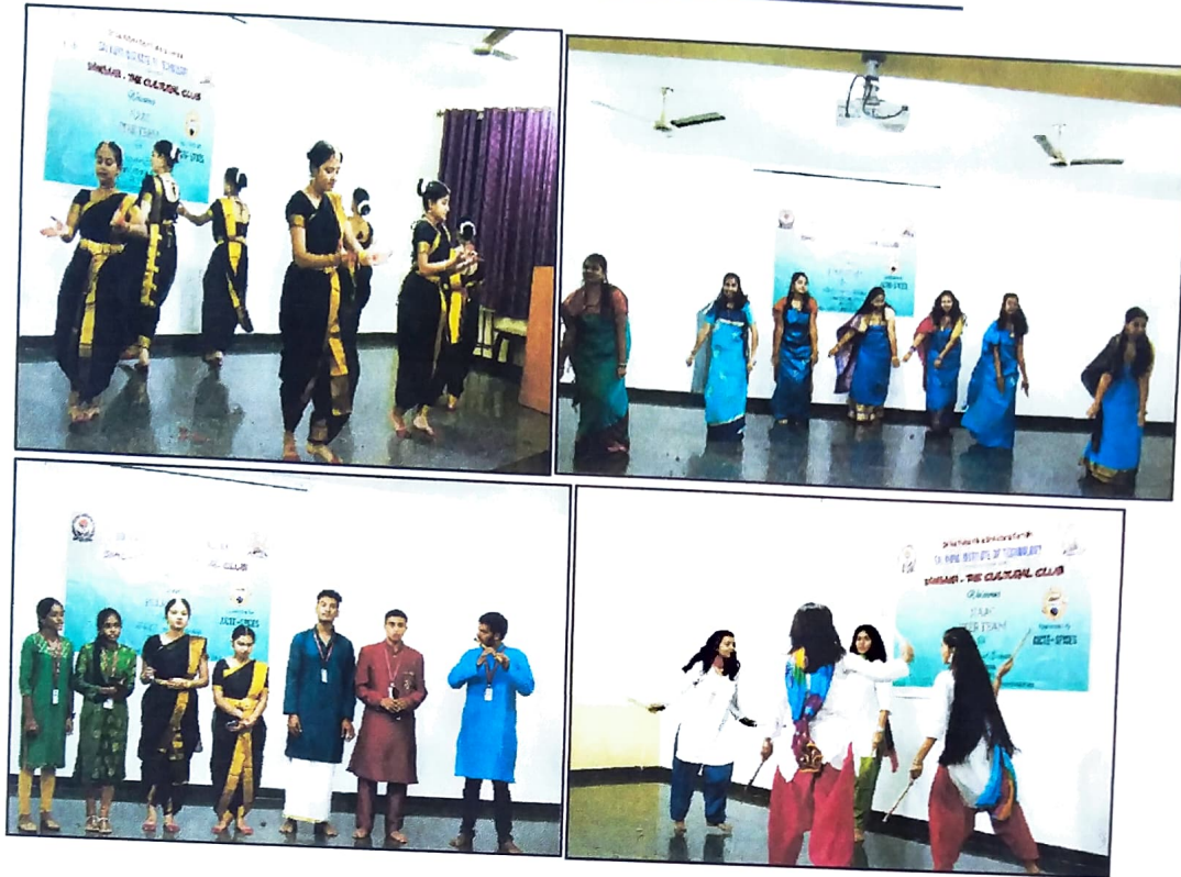
Figure 2: Images of Cultural events during NAAC audit such as Group Singing, Kodava Dance, Bharatanatyam and Group dance.