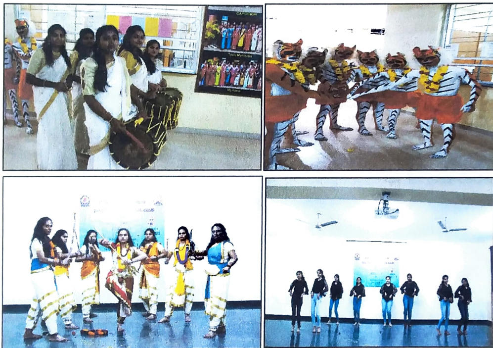
Figure 1: Images of Cultural events during NAAC audit chande, Kulivesha, Mahila Veeragaase, Group Dance.

Under the leadership of Principal sir and IQAC Coordinator guidance and Sanagama cultural team help the students organized a had a cultural evening from 05:30 PM to 06:45 PM. The NAAC Committee members along with SVIT Management, and all professor, technical faculties and staffs were present during the event. The celebration was filled with great enthusiasm among all the students and staff. The events organized by Sangama Cultural club are as follows, Chande, Hulivesha, Mahila-Veeragaase, Remix song dance, Bharathanatyam, Kolata, Kodava dance forms and SVIT dance crew portrayed the blend of the myriad colors of Indian dance form. We also had a group singing event mix of patriotic songs. The event conducted on 25/11/2022.