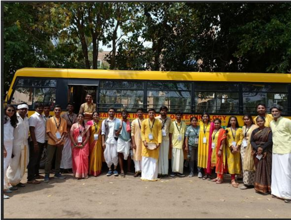
Fig. 8, Theatre club-one act play team.