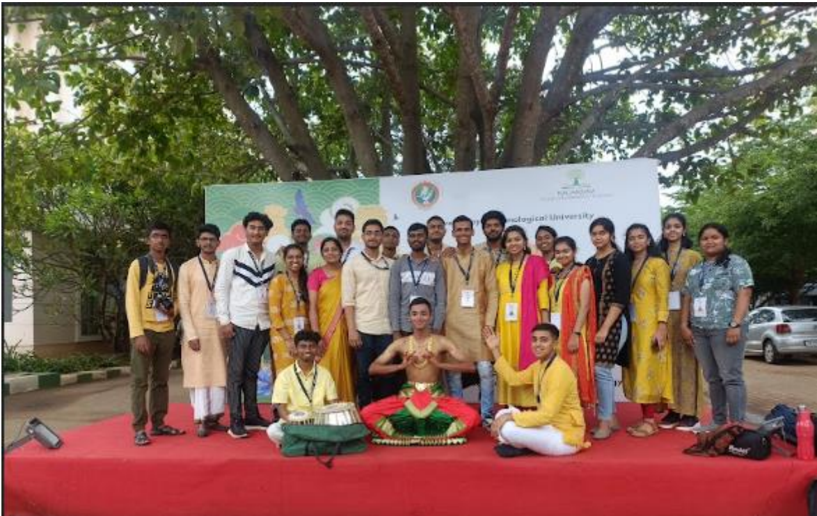
Fig 7: Day 2 group photo