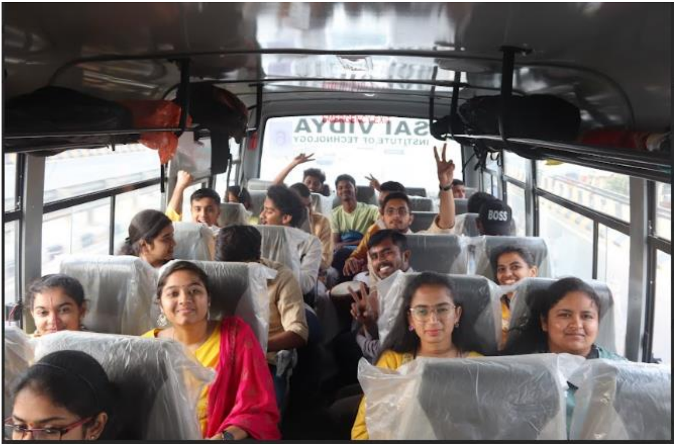
Fig. 5: Students in the SVIT Bus