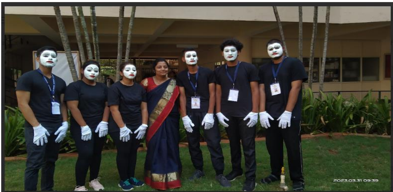
Fig 9. Glimpses of Day 3 at VTU Festival 2K23.