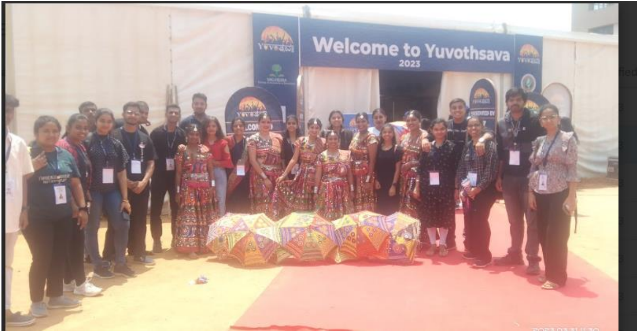
Fig 10. Group dance team at VTU Festival 2K23.