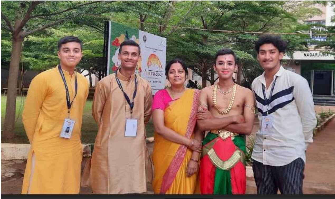
Fig. 4: Glimpses of Day 2 at VTU Festival 2K23 along with students.

RAJANUKUNTE, BENGALURU – 560 064, KARNATAKA Phone: 080-28468191/96/97/98 * E-mail: info@saividya.ac.in * URL www.saividya.ac.in