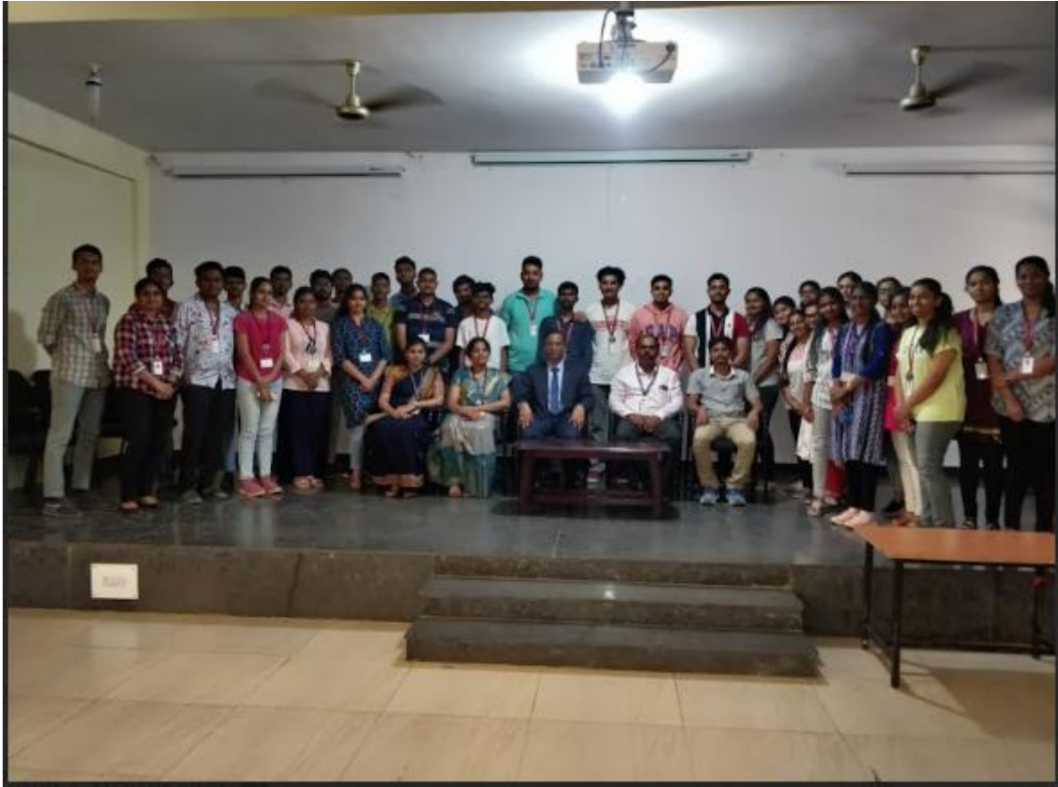
Fig 1. Group Photo, Principal Addressed about the VTU fest on 28 th March 2023.