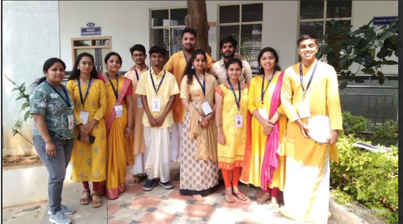
Fig. 6: Sangama Singing Team