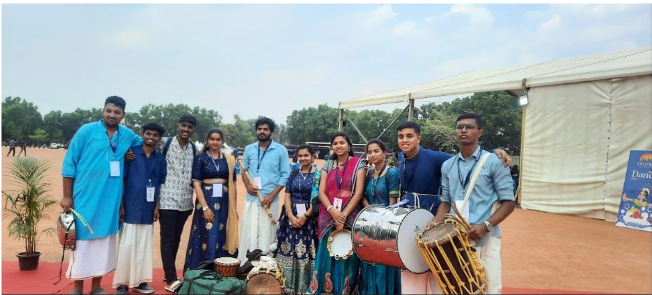
Fig 2: Folk Orchestra Team