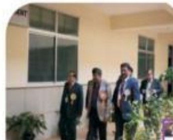
Centre for Innovation, Entrepreneurship and Incubation (CIEI)

SVIT Incubation Centre (CIEI) aims to incubate optimum feasible ideas, thus supporting emerging entrepreneurial interests among SVITians and currently teams with innovative ideas have been incubated in CIEI.