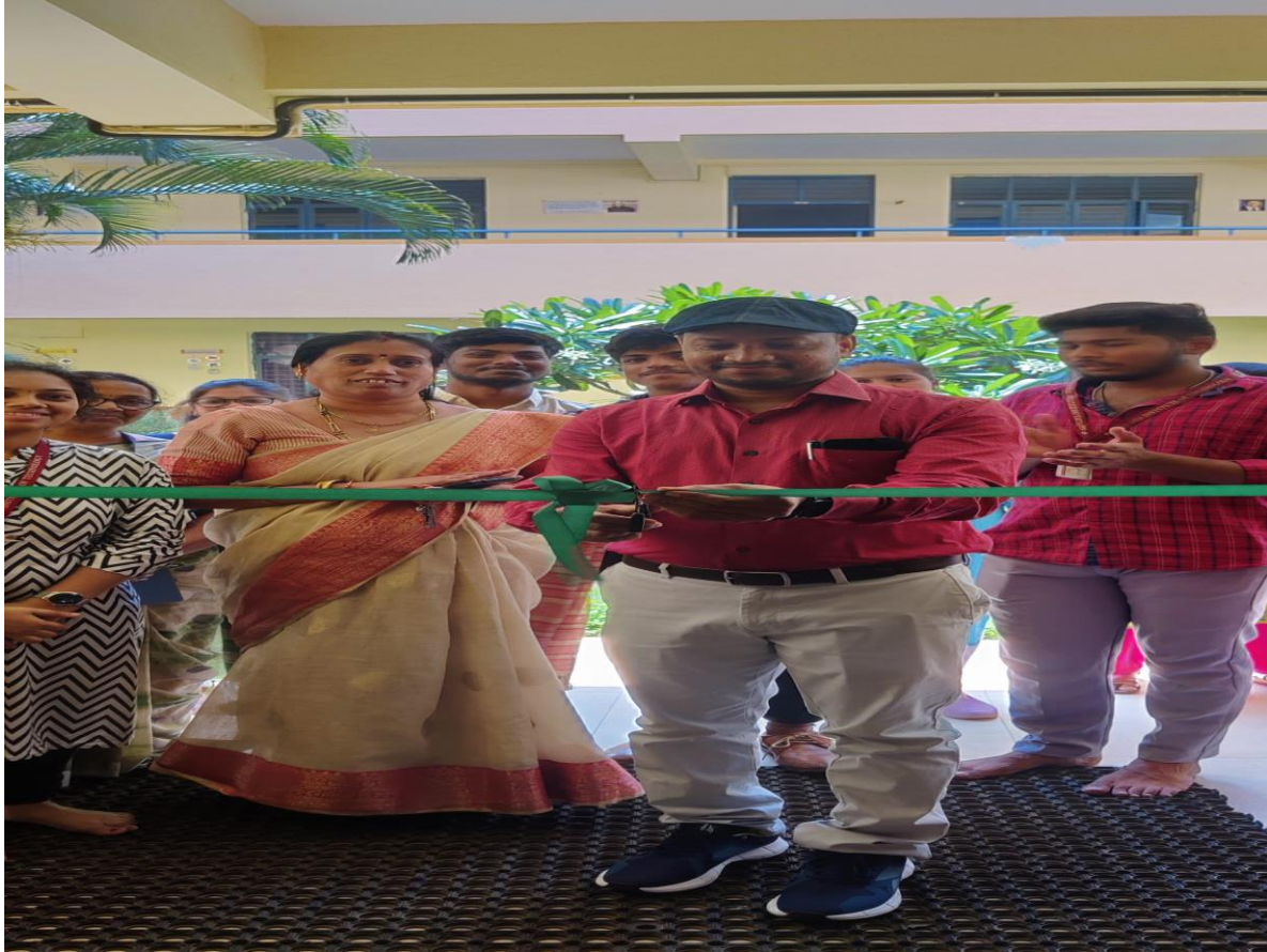
Inaugural of Project exhibition