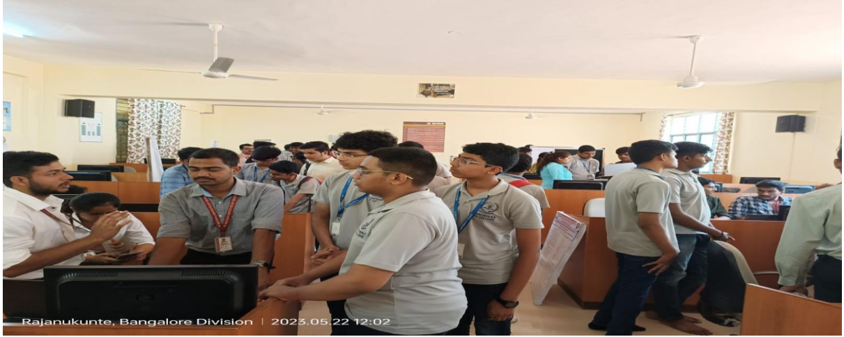
Adyayana School Children Interaction